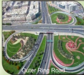
Outer Ring Road