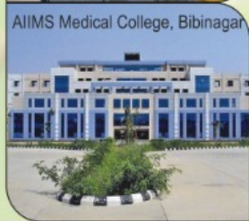
AIIMS Medical College, Bibinagar