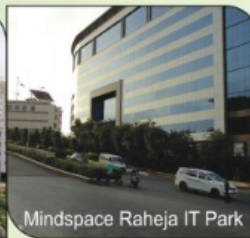
MindSpace Raheja IT Park